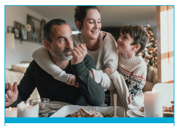
Last year, Immigrant Services and Connections completed 7,106 referrals to 1,087 different programs.

Literacy Pittsburgh was chosen to be a part of this partnership because of its history as an expert in assisting the immigrant